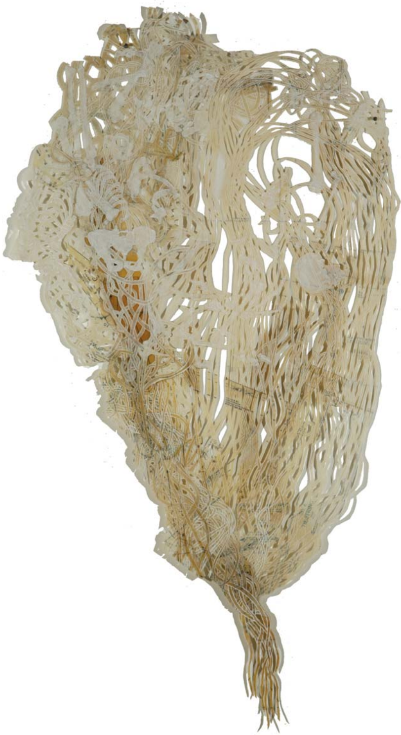
above: Bitter Love , 2006, ink, acrylic, silk, paper, polyester, 69 x 37" right: detail of Bitter Love