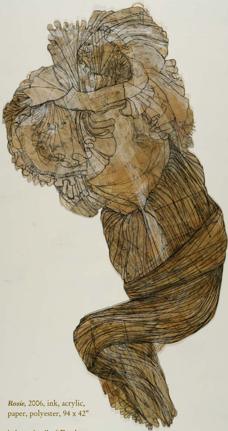
Rosie , 2006, ink, acrylic, paper, polyester, 94 x 42"