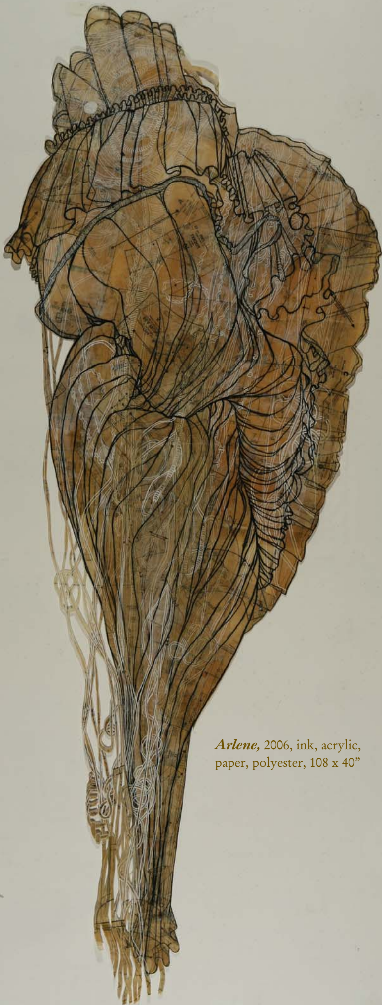
Arlene , 2006, ink, acrylic, paper, polyester, 108 x 40"