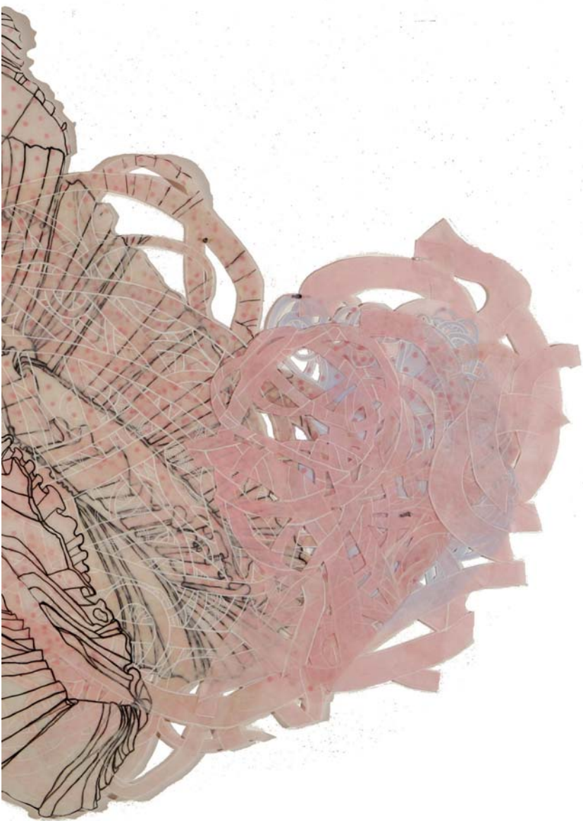
Izabella , 2006, ink, acrylic, silk, paper, polyester, 60 x 94" below: detail of Izabella