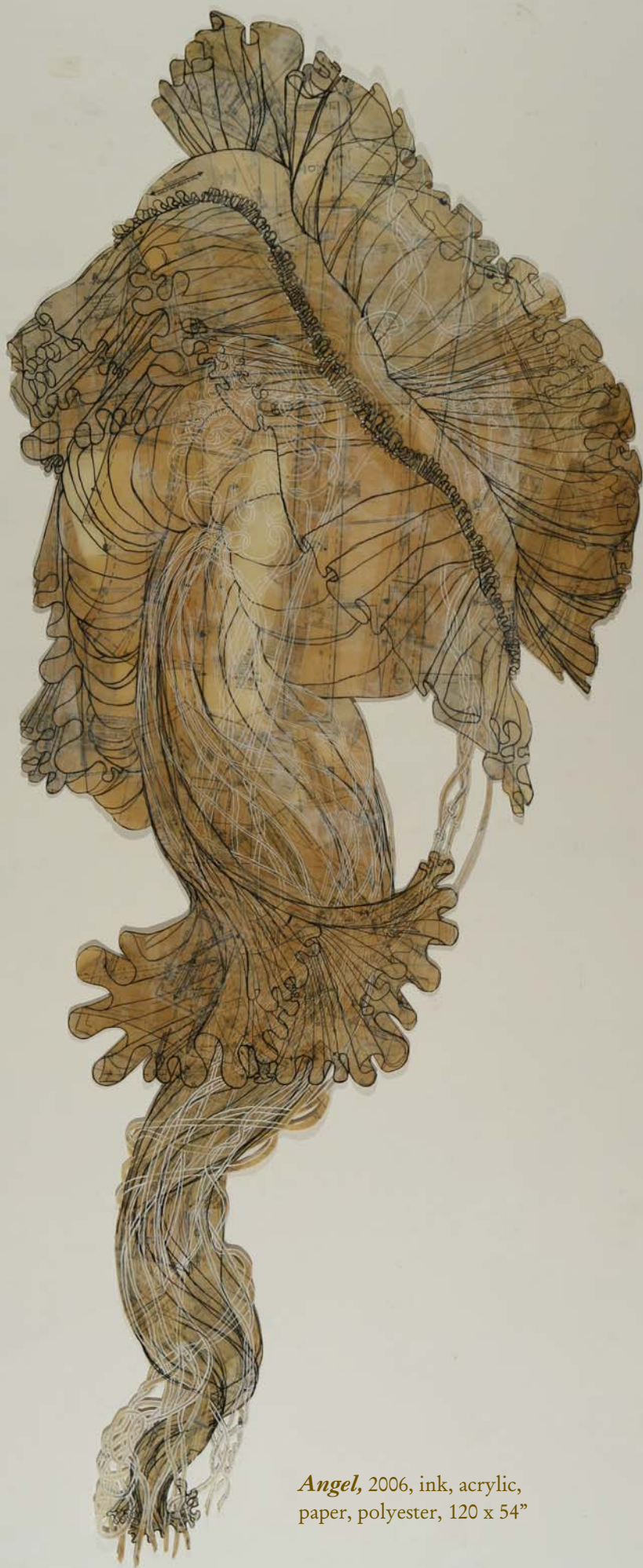
Angel , 2006, ink, acrylic, paper, polyester, 120 x 54"